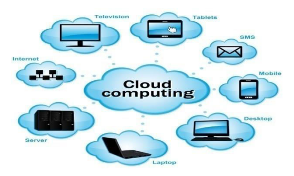
Figure 1: General Structure of Cloud Computing

the security of data and applications in case device is damaged or lost.