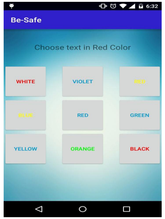
Fig 4 Color Picking