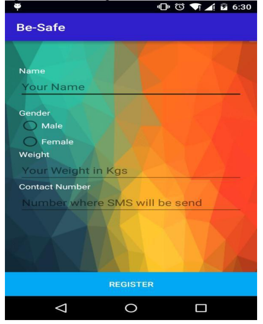
Fig 2User Registration

The second step is alcohol sensing the android application can be connected to sensor based on Arduino and MQ3 sensors. The sensor is connected to Arduino and Arduino is programmed to read value of blood alcohol content when the user blows to sensor. The sensor is can be connected to Mobile phone either using Bluetooth or USB OTG cable.