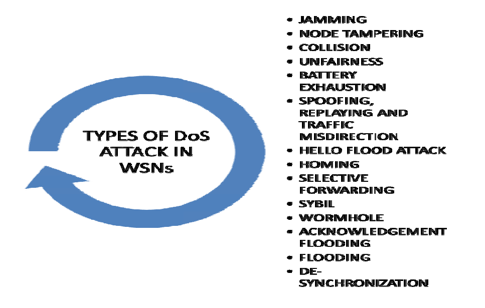
Figure 2 - Types of Denial of Attack in Wireless Sensor Network