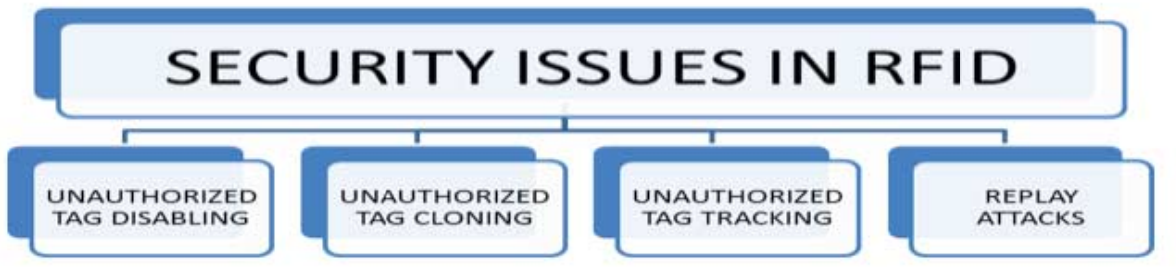
Figure 3 – Security Issues in RFID