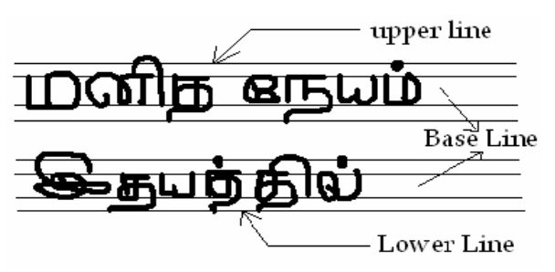
Fig.1 Reference Line Identifications

Text area from the document, which may consist of multi lines, is extracted and the segmentation step is followed. Further, each line is segmented into individual words, and finally ach word is segmented into individual characters. The method is based on horizontal projection profile corresponds to the horizontal gaps between text lines. Each text line is identified using two-reference line known as upper line and lower line. They correspond to the minimum and maximum zero value positions adjusting a text line respectively. (See Fig. 1) First derivative of the horizontal projection profile is calculated for each segmented text line. The lines drawn across the two peaks in Fig. 1 indicate the two baselines.